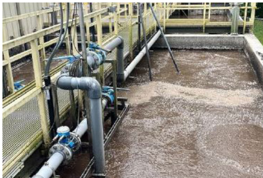
Submerged L+480 modules in Customer site.