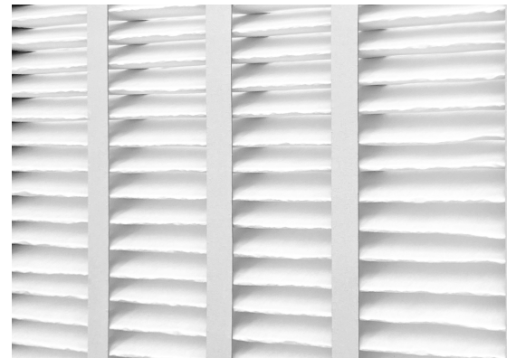
Vertical strips bonded to the media pack for extra strength

The Prime10 WL has many environmental benefits, such as reduced energy consumption that has already been mentioned. In addition, The Prime10 WL utilizes no dyes or metal in its components, and is completely incinerable.