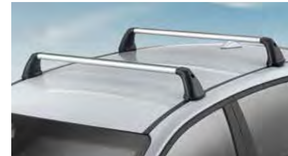
Roof rack, aluminium

99701ADE90 (U-mount adapter kit for steel roof racks / steel cross bars)