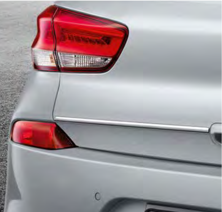
Tailgate trim line (5dr)