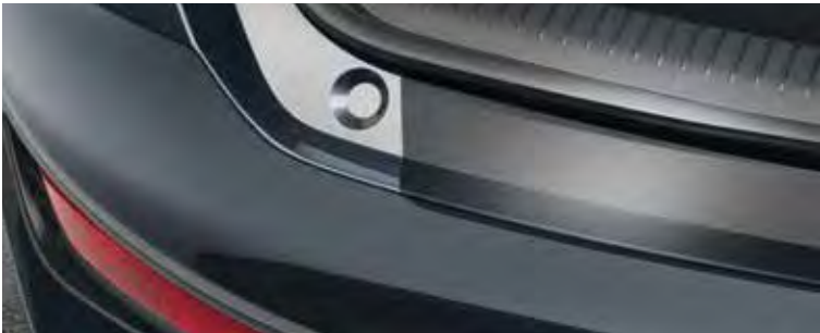
Rear bumper protection foil, black (Fastback)