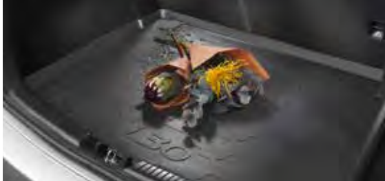
Trunk liner (5dr)