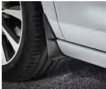
Mudguard kit, front