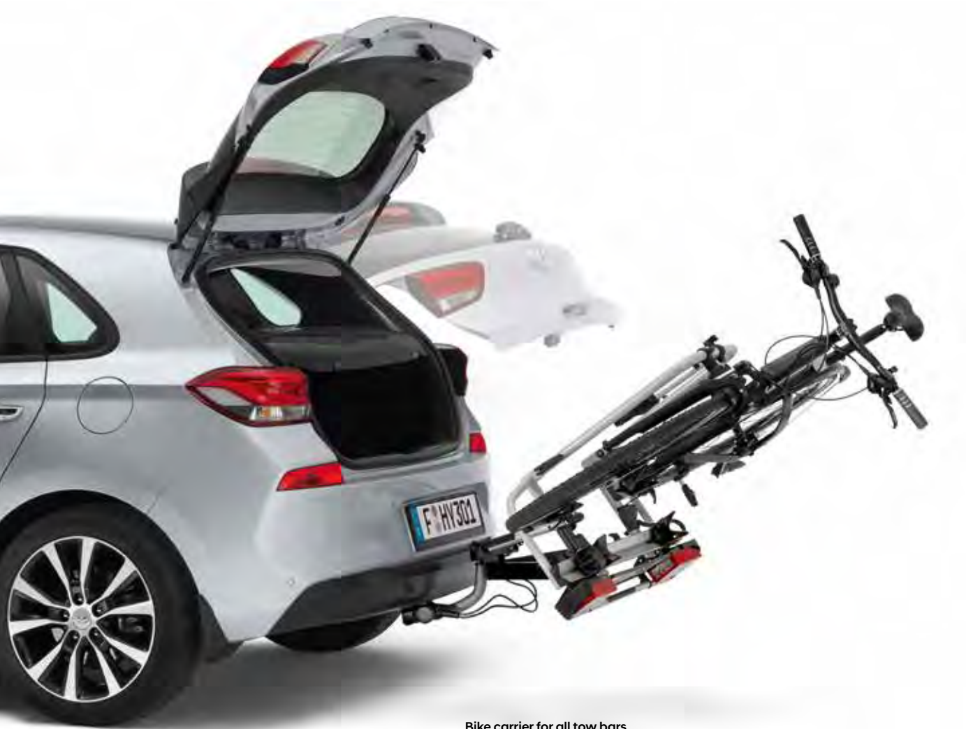
Bike carrier for all tow bars

Sturdy accessories that make it so easy to carry your lifestyle with you on all your adventures.