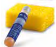
Summer car care kit