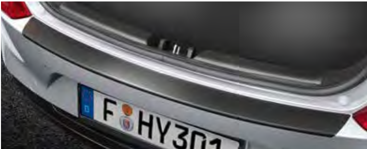
Rear bumper protection foil, black (5dr)