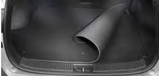
Trunk mat, reversible (Wagon)