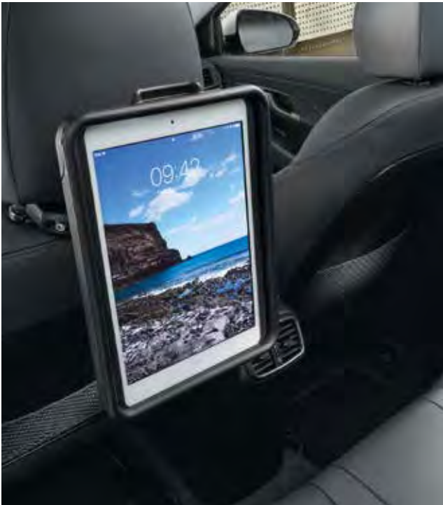
Rear seat entertainment cradle for iPad®