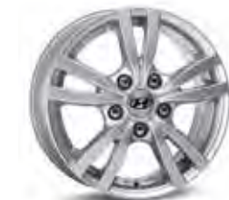
Alloy wheel 15" Asan