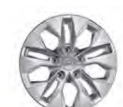
Steel wheel cover 15"