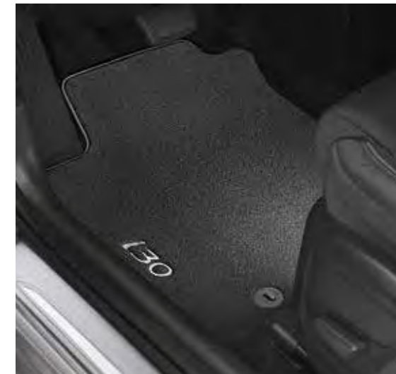
Textile floor mats, velour