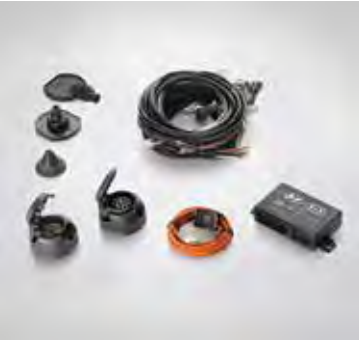
Tow bar wiring kit

Looking for a convenient and reliable solution to transport heavy loads on a regular basis? This corrosion-resistant tow bar gets full marks in all disciplines. Maximum payload for bike carrier usage is 75 kg including bike carrier weight. Certified according to UNECE 55R. G4280ADE00 (5dr) G4280ADE10 (Wagon / application only for vehicles without OE rear park distance control)