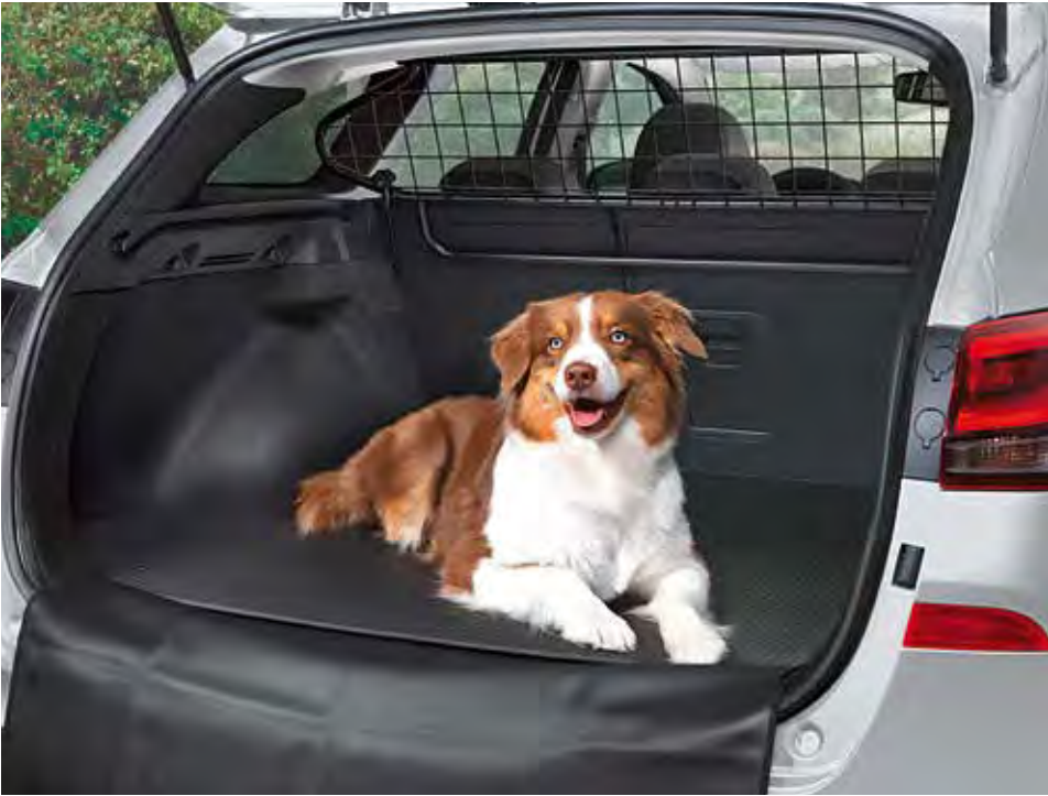
Cargo separator, upper frame

Cargo separator, upper frame Fitting perfectly between the rear seatbacks and the roof, this robust product protects vehicle passengers from the movement of items or pets in the trunk. The easy to install grid is designed not to restrict the driver's rearward view. Only for vehicles with safety barrier net option. G4150ADE10 (Wagon)