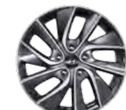
Alloy wheel 17"