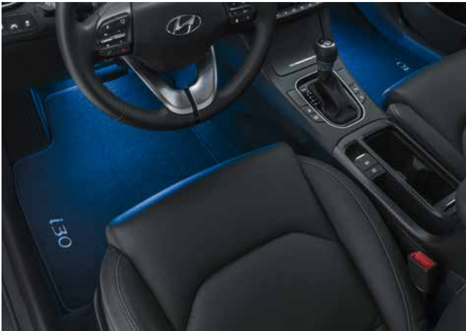
LED footwell illumination, blue, first row

Accentuate the premium flair of your cabin with concealed illumination of the footwell. It creates a welcome glow of refined ambient light whenever the doors are opened and closed, fading out as the engine starts. Available in stylish blue and classic white. 99650ADE20W (white, first row) 99650ADE20 (blue, first row)