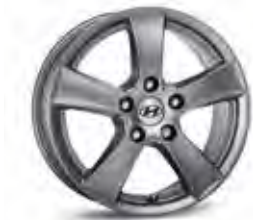
Alloy wheel 15" Mabuk Alloy wheel 16" Mabuk