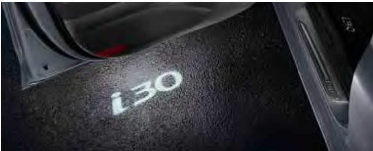
LED door projectors, i30 logo

Introduce more finesse into the darkness, by featuring the Hyundai logo on the ground next to your open front doors. Projected with a clear focus and distinct radiance – for a refined touch to every entrance. 99651ADE00H 99651ADE99 (additional cable kit for vehicles without smart key)