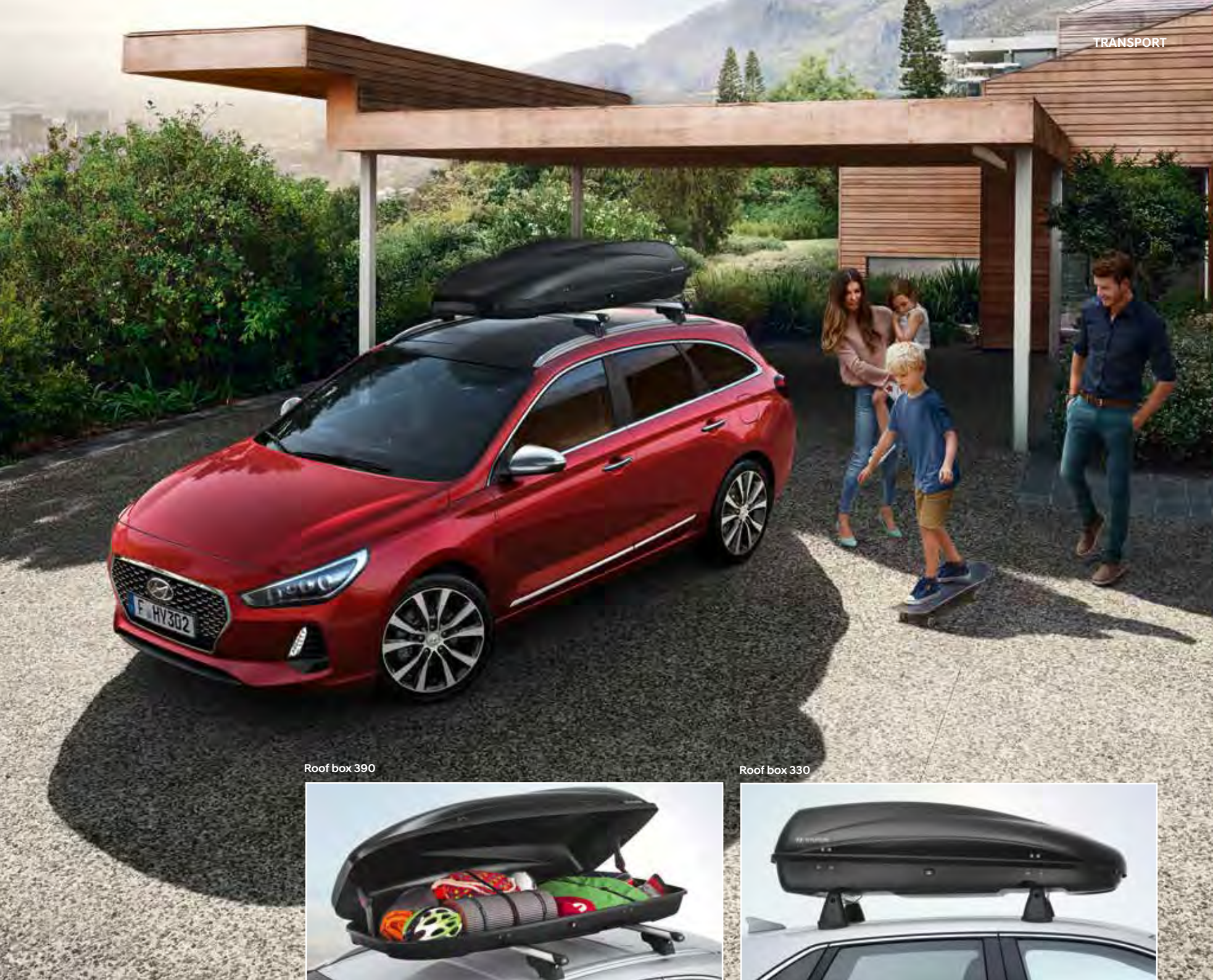
Roof box 390

Roof box 330 & 390 Whatever the reason, whatever the season: when you require additional storage for your i30, these roof boxes give you both quality and quantity. Aerodynamic and sleek, easy to install and robust, it also features dual side opening for fast loading and unloading. Lockable for theft prevention. 99730ADE10 (Roof box 330 / 5dr, Wagon) Dimensions: 144x86x37.5 cm / Volume: 330 L / Capacity: up to 75 kg 99730ADE00 (Roof box 390 / 5dr, Wagon) Dimensions: 195x73.8x36 cm / Volume: 390L / Capacity: up to 75 kg