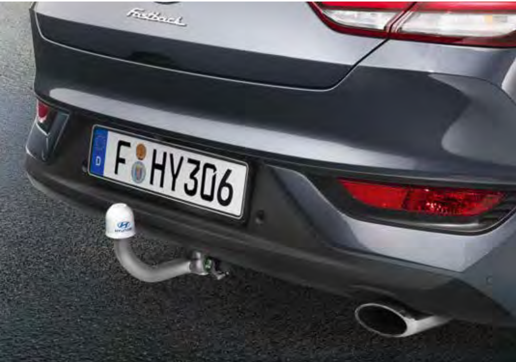
Tow bar, detachable

Maximum towing load capacity will depend on your car's specification. Please consult your dealer for further information. All Hyundai i30 Genuine tow bars are corrosion resistant, certified by ISO 9227NSS salt spray test, and comply with OE Car Loading Standard (CARLOS) – Trailer Coupling (TC) and Bike Carrier (BC) requirements.