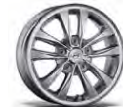
Alloy wheel 15"

Make safety and driving efficiency a top priority, with genuine sensors for optimum tyre functionality. The TPMS kit lets you monitor air pressure levels in your tyres at all times. F2F40AK990 (not shown)