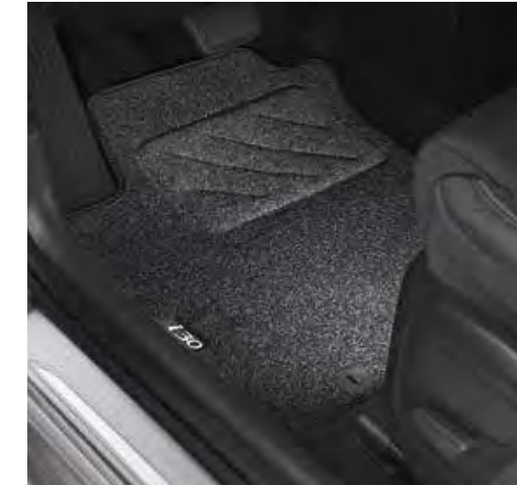
Textile floor mats, standard