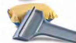
Winter car care kit