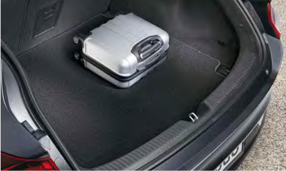
Trunk mat, reversible (Fastback)