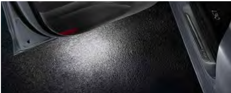
LED puddle lights

Groundbreaking, ground-illuminating. These LED door projectors are activated every time your i30 front doors are opened – shining a subtle yet sharp glow on the ground for a uniquely stylish entry, complete with the i30 logo. G4651ADE00 99651ADE99 (additional cable kit for vehicles without smart key)