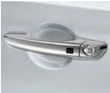
Door handle recess protection foil

Covered and carefree. This black film gives you the peace of mind of knowing that the top surface of your rear bumper is protected from scrapes and scuffs.