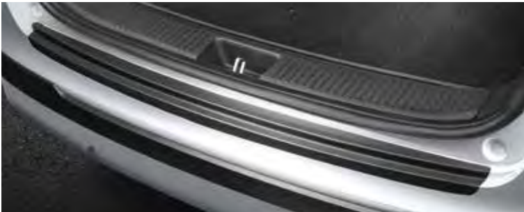
Rear bumper protection foil, black (Wagon)