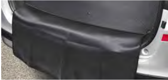
Bumper flap for trunk mat, reversible (Wagon)