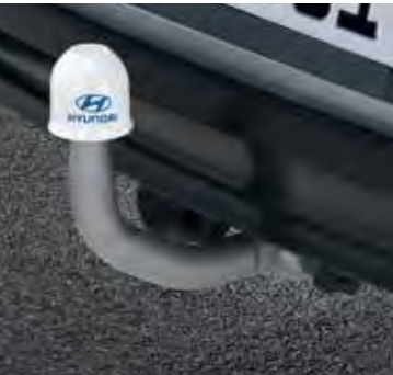
Tow bar, detachable

Detachable and above all dependable: You can rely on this corrosion-resistant steel tow bar to transport your cargo securely and efficiently. Featuring a 3-ball locking system, it can be simply detached. Maximum payload for bike carrier usage is 75 kg including bike carrier weight. Certified according to UNECE 55R. G4281ADE00 (5dr) G4281ADE10 (Wagon) G4281ADE20 (Fastback)