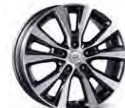
Alloy wheel 17"