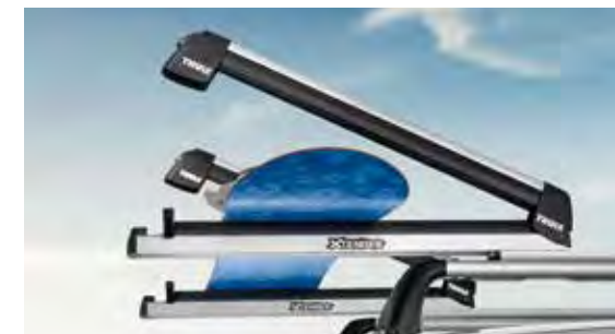
Xtender ski & snowboard carrier