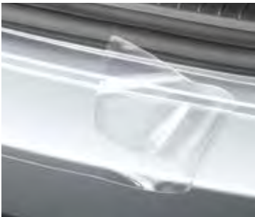
Rear bumper protection foil, transparent