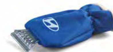
Ice scraper with glove

LP982APE1BROH (bronze pack) LP982APE1SILH (silver pack) LP982APE1GOLH (gold pack)