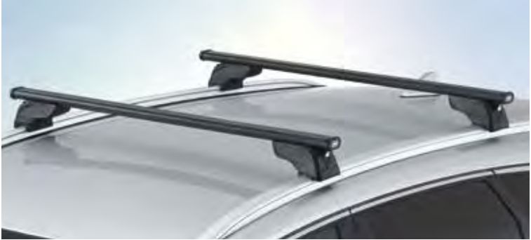
Cross bars, steel

Roof box 330 & 390 Whatever the reason, whatever the season: when you require additional storage for your i30, these roof boxes give you both quality and quantity. Aerodynamic and sleek, easy to install and robust, it also features dual side opening for fast loading and unloading. Lockable for theft prevention. 99730ADE10 (Roof box 330 / 5dr, Wagon) Dimensions: 144x86x37.5 cm / Volume: 330 L / Capacity: up to 75 kg 99730ADE00 (Roof box 390 / 5dr, Wagon) Dimensions: 195x73.8x36 cm / Volume: 390L / Capacity: up to 75 kg