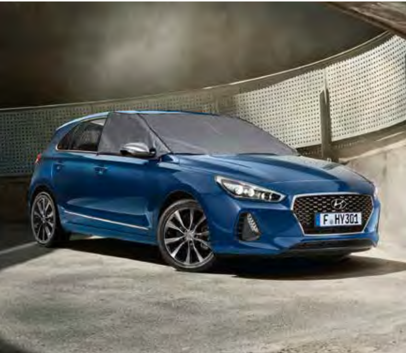
Ice / sunscreen

Thoroughly practical and ingenious solutions that make every journey more comfortable and convenient for you and your passengers.