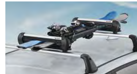
Ski & snowboard carrier 400