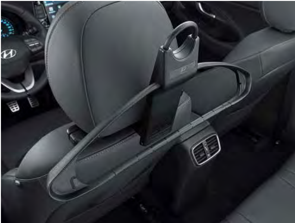
Business suit hanger