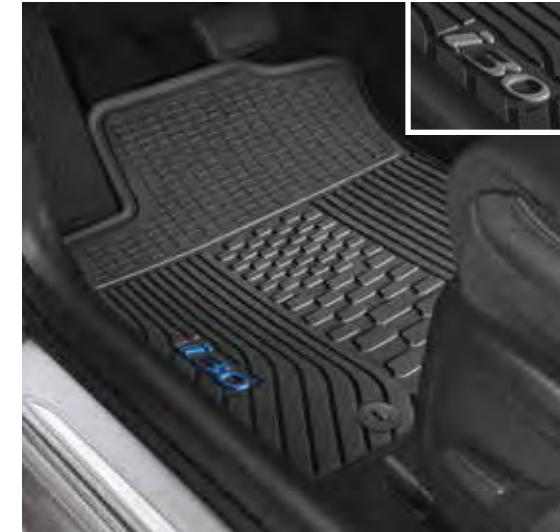
All weather mats, with colour accent

Keeping your new i30 clean and tidy will also help preserve its value and good looks.