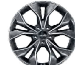
Alloy wheel 18"