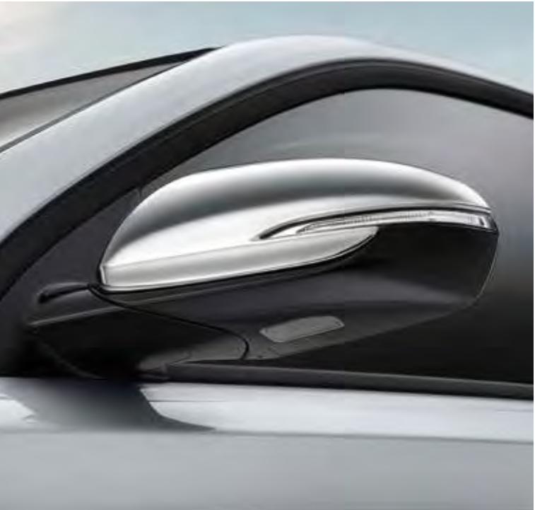
Door mirror caps

The elegant high gloss stainless rear bumper protector on page 29 harmoniously complements these bright styling elements.