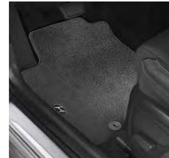
Textile floor mats, premium