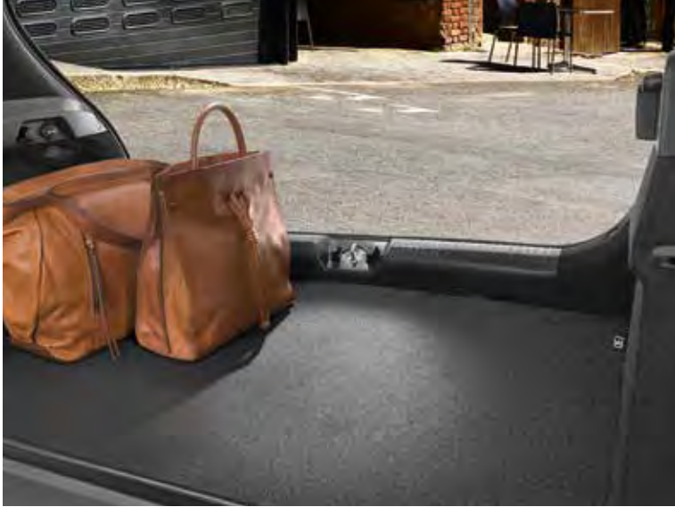
Trunk mat (5dr)

Trunk liner From gardening tools to family pets – some cargo can be potentially wet or grimy. This durable, anti-slip and waterproof liner with raised edges will keep your trunk clean nonetheless. With a textured anti-slip surface to prevent loads moving around. Made-to-measure for the i30. G4122ADE00 (5dr, for vehicles with luggage undertray) G4122ADE10 (5dr, for vehicles without luggage undertray) G4122ADE20 (Wagon MY 17) G4122ADE21 (Wagon MY 18)