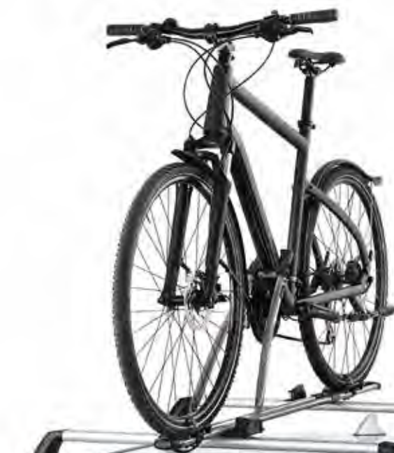
Bike carrier Active