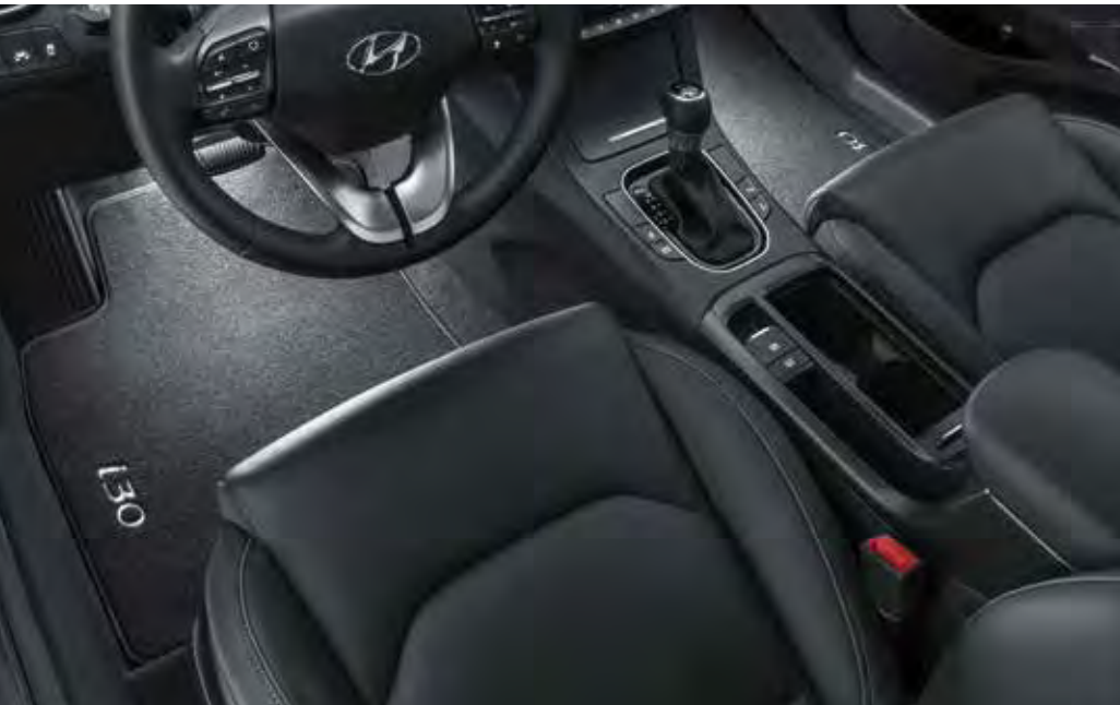
LED footwell illumination, white, first row

Complement the confident and timeless design of your new i30 with your choice of accessories that are both stylish and practical.