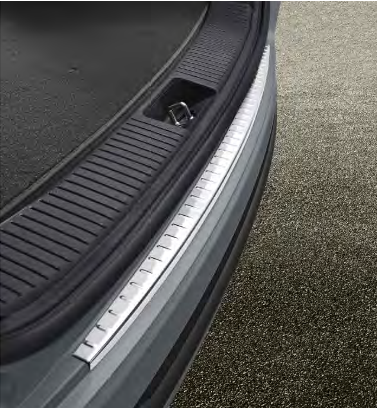
Rear bumper protector