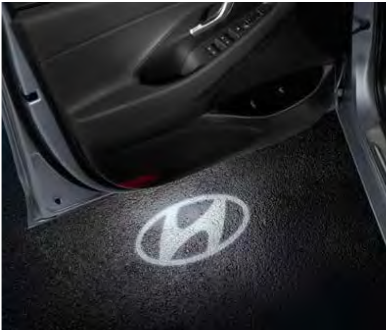
LED door projectors, Hyundai logo

Accentuate the premium flair of your cabin with concealed illumination of the footwell. It creates a welcome glow of refined ambient light whenever the doors are opened and closed, fading out as the engine starts. Available in stylish blue and classic white. 99650ADE20W (white, first row) 99650ADE20 (blue, first row)