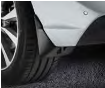
Mudguard kit, rear