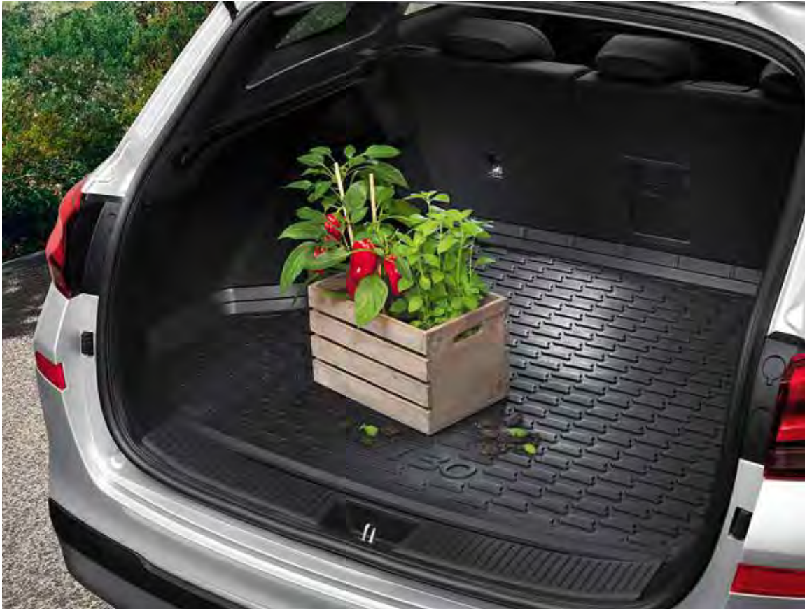
Trunk liner (Wagon)