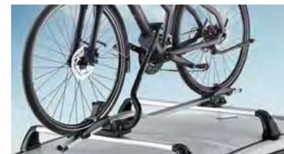
Bike carrier Pro