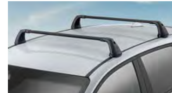
Roof rack, steel