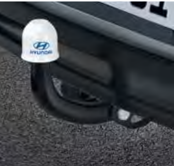
Tow bar, fixed

Looking for a convenient and reliable solution to transport heavy loads on a regular basis? This corrosion-resistant tow bar gets full marks in all disciplines. Maximum payload for bike carrier usage is 75 kg including bike carrier weight. Certified according to UNECE 55R. G4280ADE00 (5dr) G4280ADE10 (Wagon / application only for vehicles without OE rear park distance control)