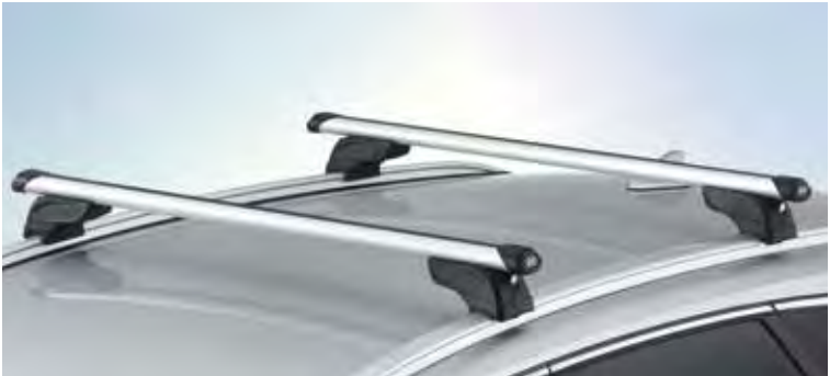
Cross bars, aluminium

Cross bars, aluminium Get more space for your adventures. These secure, lightweight cross bars are purpose-built for the i30 Wagon roof rails and easy to install. So you can set off on future trips with all you need. Only suitable for cars with OE roof rails. Fits for vehicles with and without a panoramic sunroof. G4211ADE00AL (Wagon)