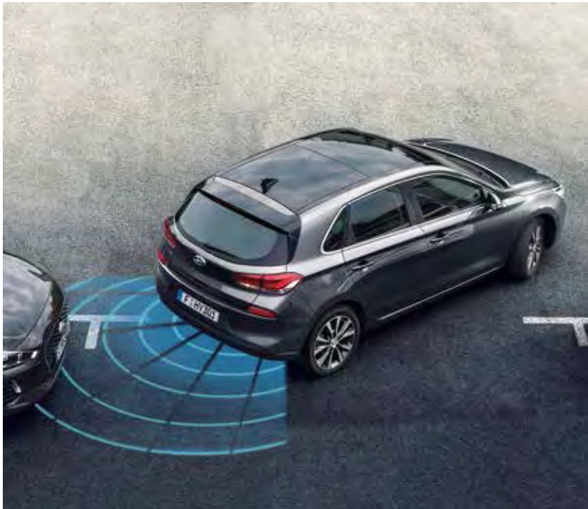
Park distance control, rear

Comfort and visibility, all year round. This screen shields your cabin from heat build-up on sunny days and prevents ice forming on your wind-screen in freezing temperatures. Custom-made for the i30, it is theft-proof when fitted.