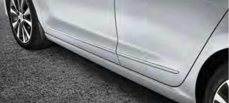
Side trim lines