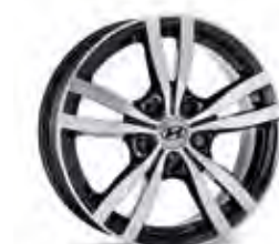
Alloy wheel 16" Asan