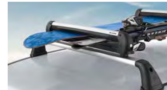
Ski & snowboard carrier 600