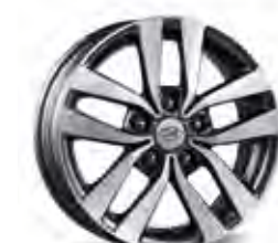
Alloy wheel 16"