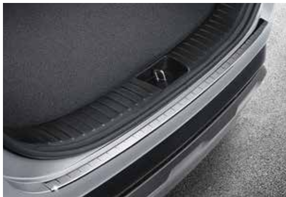
Rear bumper protector