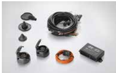
Towbar wiring kit