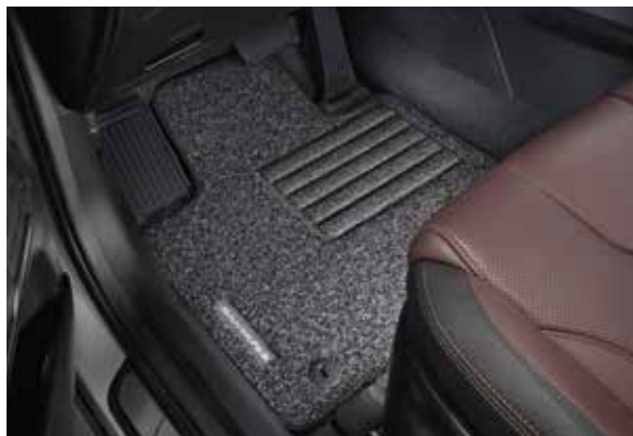
Textile floor mats, standard