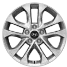
1. Alloy wheel kit 17"

Emphasize your family's impressive character with alloy wheels that add an extra level of style. All Hyundai Genuine wheels are engineered to the same stringent standards as your Santa Fe.