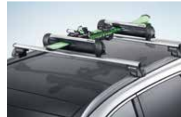
Ski & snowboard carrier 400