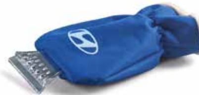
Ice scraper with glove