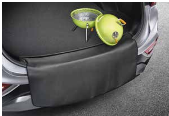
Trunk mat &amp; Bumper flap

Enjoy double the protection with two flippable surfaces – high-quality velour on one side, and a resilient dirt-resistant finish on the other – to suit the whole range of different transports life brings with it. With press buttons for fixation of the fold-out bumper flap for extra protection. S1120ADE17 (7-seater, foldable) S1120ADE07 (7-seater / not shown)