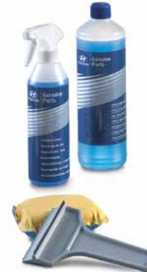
Winter car care kit