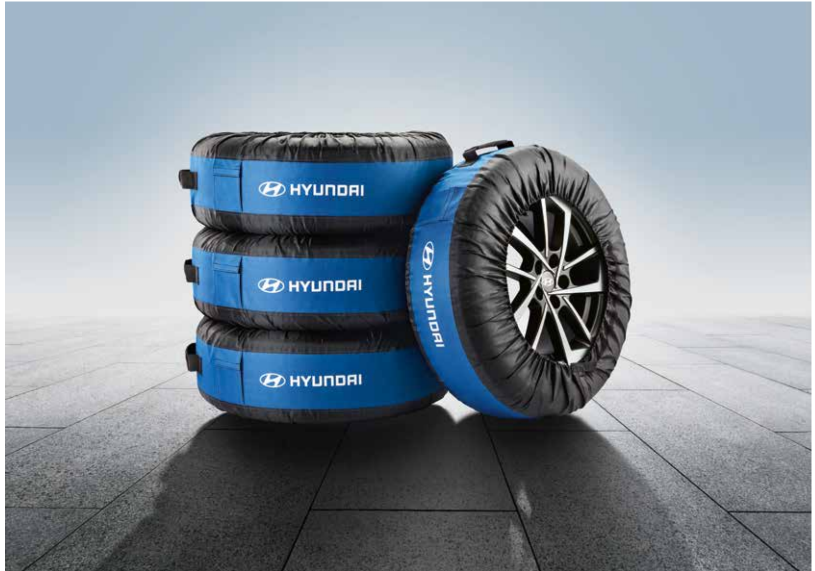
Wheel storage bags, 99495ADB00

TPMS kit Make safety and driving efficiency a top priority, with genuine sensors for optimum tyre functionality. The TPMS kit lets you monitor air pressure levels in your tyres at all times. LP52933C1100K