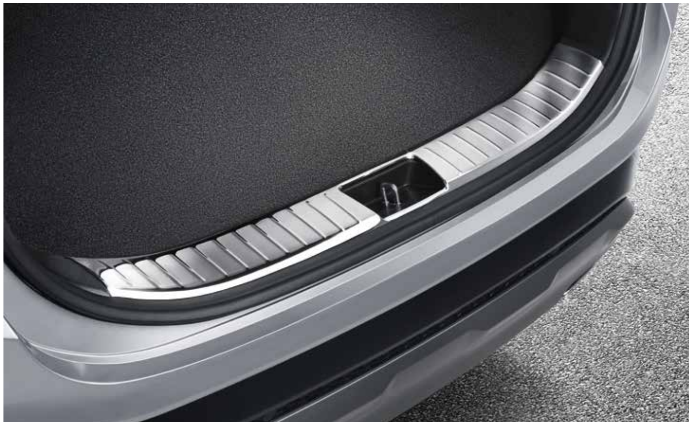
Trunk sill protector