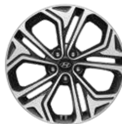
3. Alloy wheel kit 19"