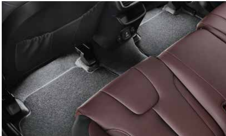
LED footwell illumination, white, second row