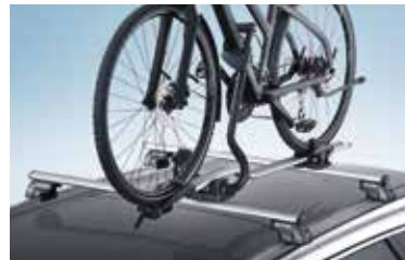
Bike carrier Pro