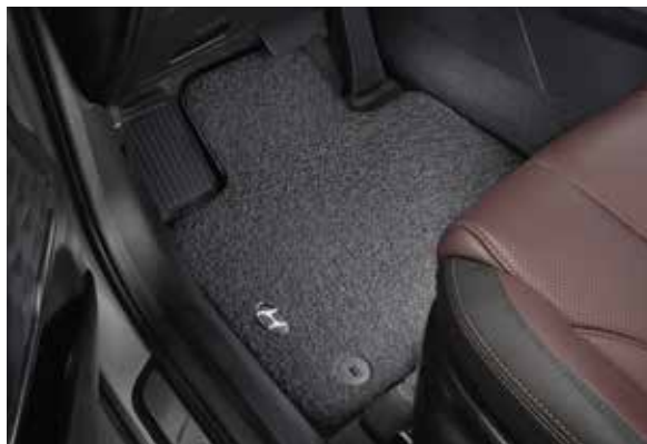
Textile floor mats, premium

You never know where your active family wants to be taken. Or what they want to take with them. So we've developed a range of good-looking and practical solutions that will keep your Santa Fe looking like new.