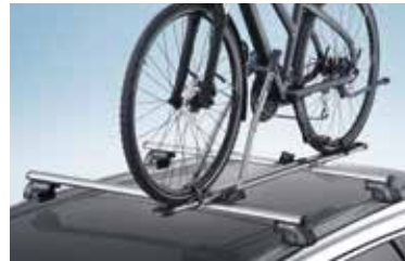
Bike carrier Active