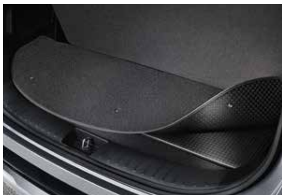
Trunk mat, reversible (foldable)