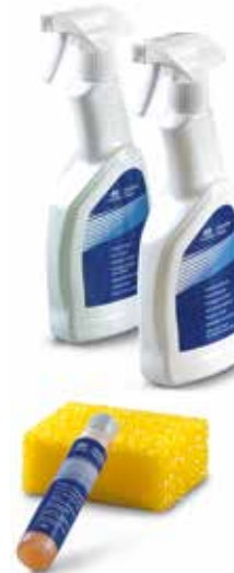
Summer car care kit