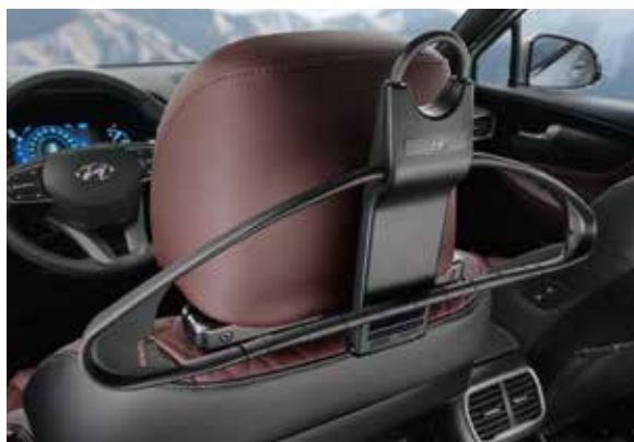
Business suit hanger

Comfort and visibility, all year round. This screen shields your cabin from heat build-up on sunny days and prevents ice forming on your windscreen in freezing temperatures. Custom-made for the Santa Fe, it is theft-proof when fitted. S1723ADE00