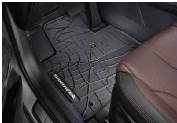
All weather mats