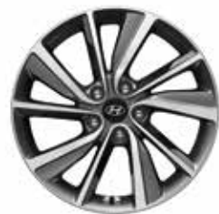
2. Alloy wheel kit 18"