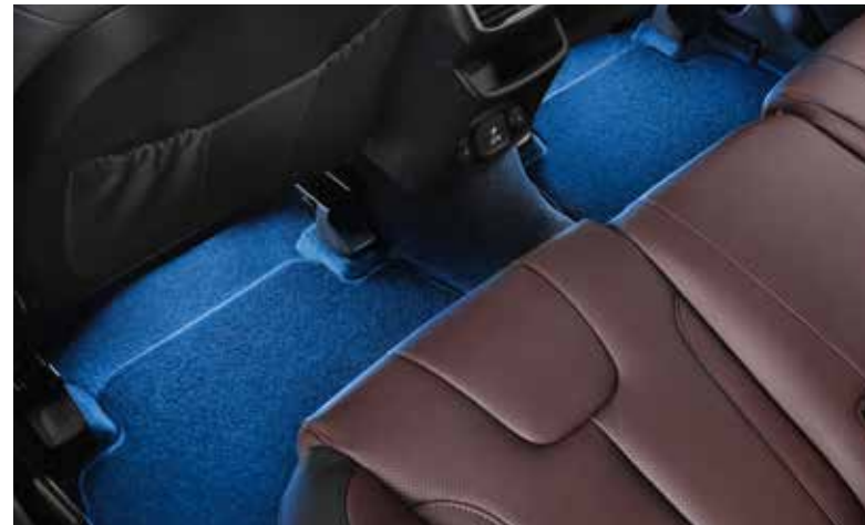
LED footwell illumination, blue, second row