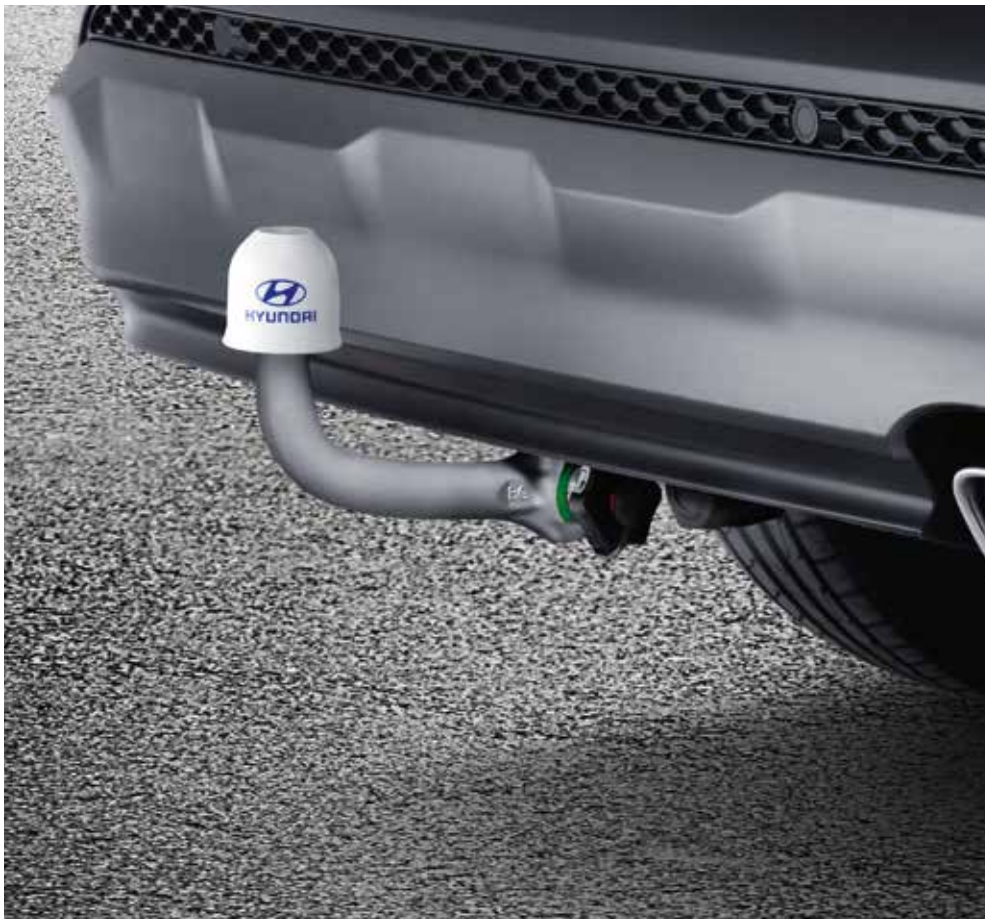
Tow bar, detachable