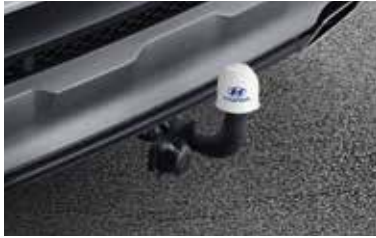
Tow bar, fixed