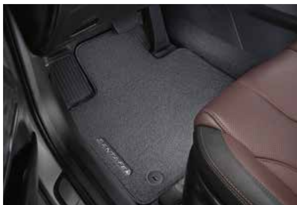
Textile floor mats, velour