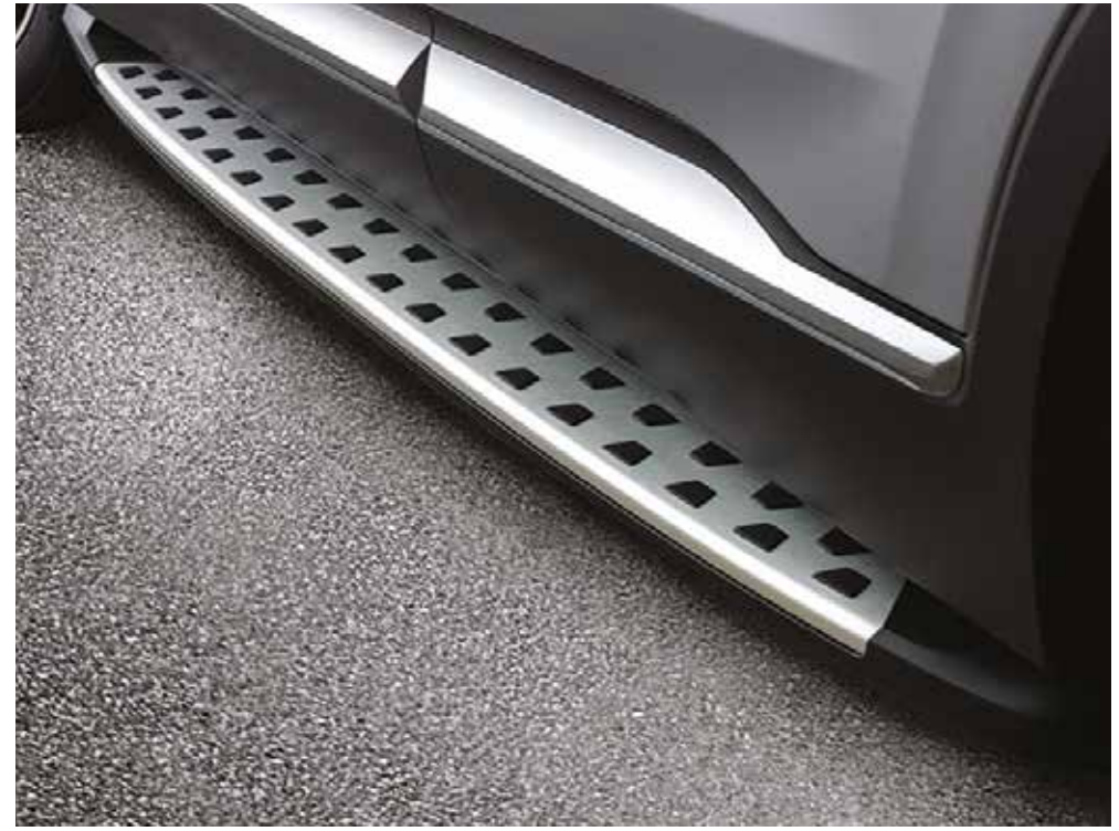
Side steps, sporty