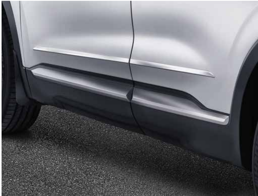
Side trim lines