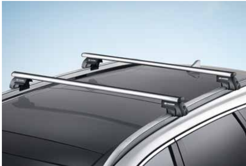
Cross bars, aluminium

The family-friendly solution to action packed winter holidays. The “Ski & snowboard carrier 400” for up to 4 pairs of skis or 2 snowboards. It is fast and convenient to fit, and can even be locked to keep your gear secure. For even more storage space you can opt for the “Ski & snowboard carrier 600” for up to 6 pairs of skis or 4 snowboards. 99701ADE10 (400) 99701ADE00 (600)