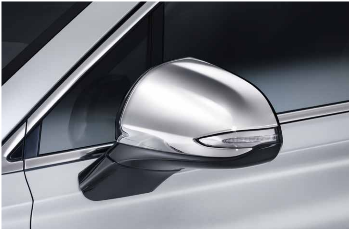
Door mirror caps