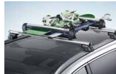
Ski & snowboard carrier 600