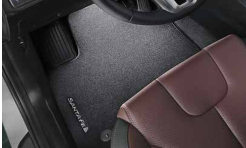
LED footwell illumination, white, first row