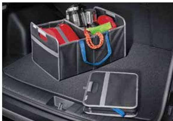
Trunk organizer, foldable