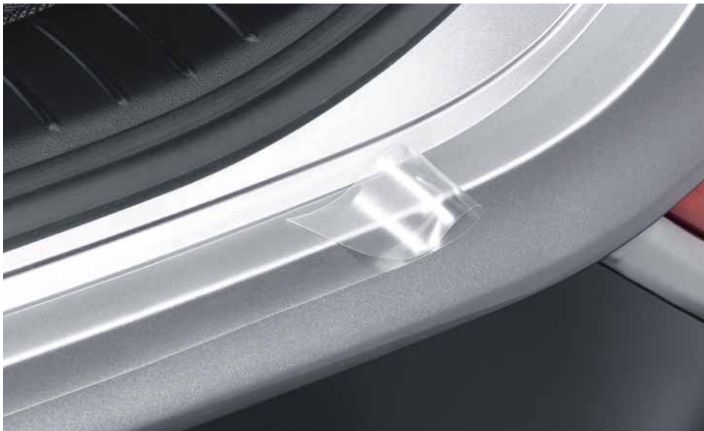
Rear bumper protection foil, transparent