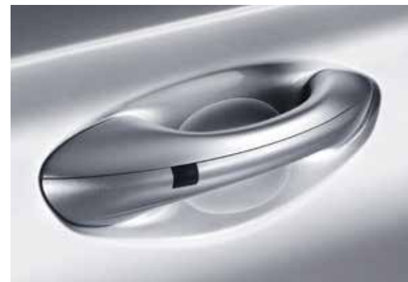
Door handle recess protection foils