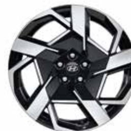
4. Alloy wheel kit 20"