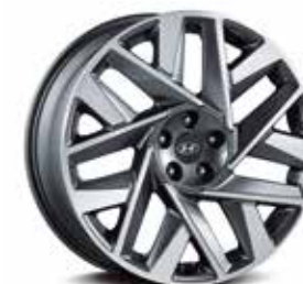
5. Alloy wheel kit 20"