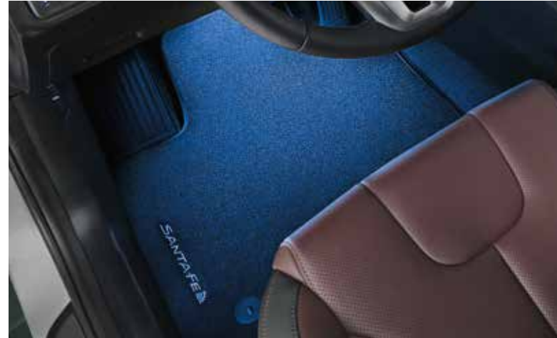
LED footwell illumination, blue, first row