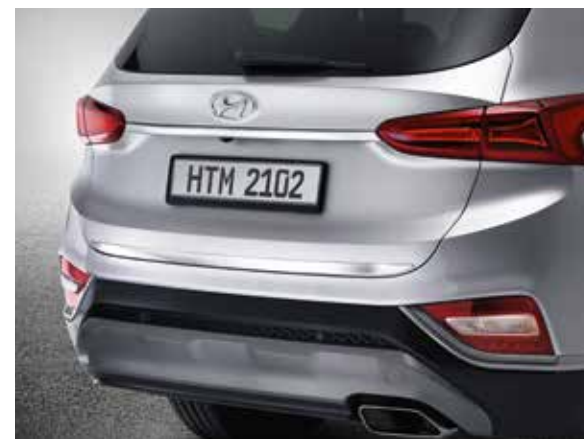
Tailgate trim line