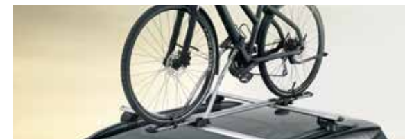
Bike carrier Active