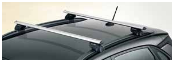
Cross bars, aluminium

99701ADE90 (U-mount adapter kit for steel cross bars)