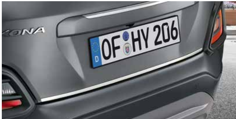
Tailgate trim line, chrome optic