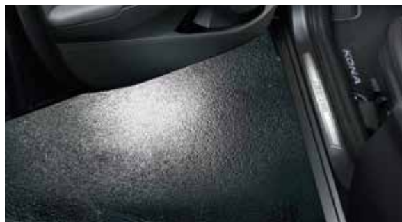
LED puddle lights