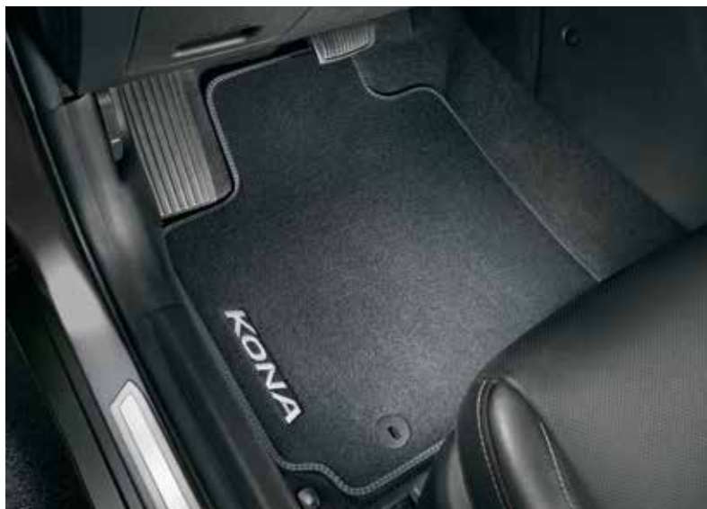
Textile floor mats, velour

Introduce a good-looking yet hard-wearing floor covering to your KONA Electric in high-quality velour. The tailor-made mats with striking grey double stitching feature the grey KONA logo in the front row and are held in place with fixing points and anti-slip backing. K4143ADE00 (LHD, set of 4)