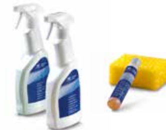
Summer car care kit