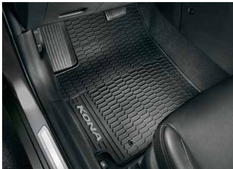
All weather mats, with grey accent

Introduce a good-looking yet hard-wearing floor covering to your KONA Electric in high-quality velour. The tailor-made mats with striking grey double stitching feature the grey KONA logo in the front row and are held in place with fixing points and anti-slip backing. K4143ADE00 (LHD, set of 4)