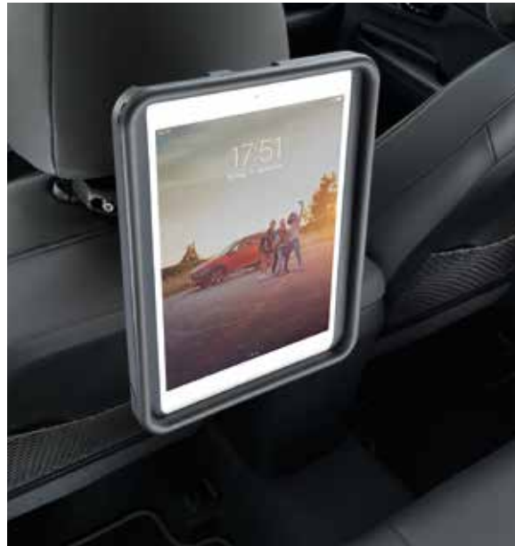
Rear seat entertainment cradle for iPad®