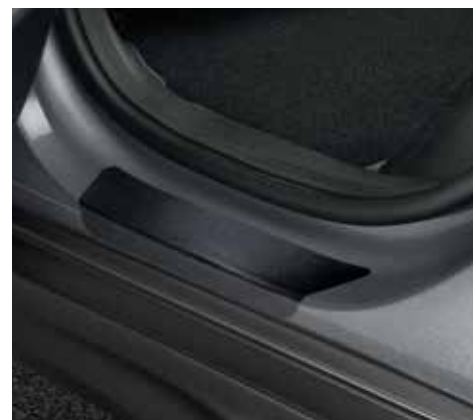
Door sill protection foils, black (rear)