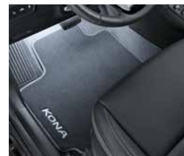
LED footwell illumination, white, first row

99651ADE99 (additional cable kit to be purchased)