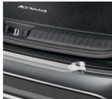
Rear bumper protection foil, transparent