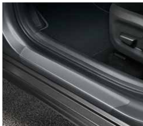
Door sill protection foils, transparent (front)