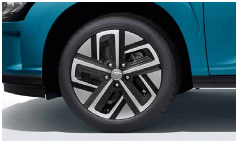
1. Alloy wheel kit 17" 17" five-spoke alloy wheel, 7.0Jx17", suitable for 215/55 R17 tyres. Kit includes a central cap. 52910DD100B