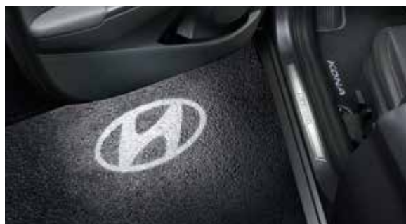
LED door projectors, Hyundai logo

J9651ADE00 (additional LED connection kit not required)