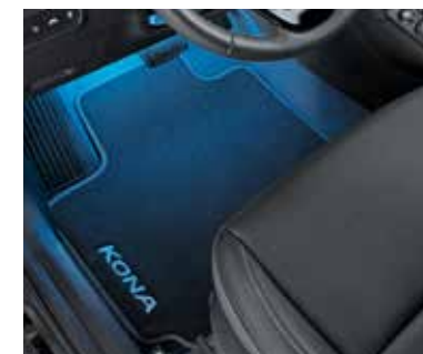
LED footwell illumination, blue, first row