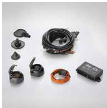
Tow bar wiring kit