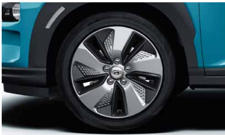
2. Alloy wheel kit 17" This 7.0Jx17" five-spoke alloy wheel kit includes a full set of silver alloy wheels and lightweight quality anthracite plastic wheel covers to complement the KONA Electric's look. Suitable for 215/55 R17 tyres. Kit includes a central cap, five grey covers. K4F40AK000