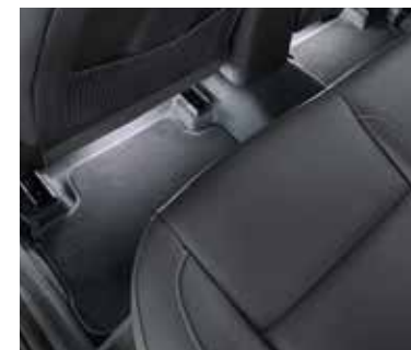
LED footwell illumination, white, second row