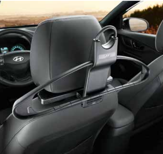
Business suit hanger