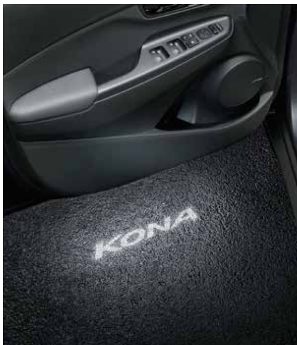
LED door projectors, KONA logo

Add that personal touch with these Styling Accessories. Such that everyone is amazed by your KONA's quite unique appearance.