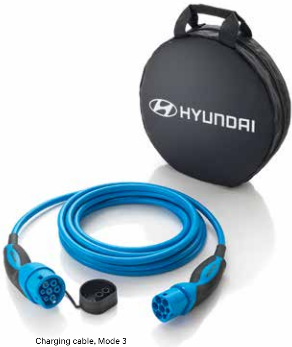
Charging cable, Mode 3

Charging your KONA Electric could not be easier, smarter and faster. The high-quality Charging cable, Mode 3 is designed and engineered to function faultlessly and to withstand rough handling and extreme climatic conditions.