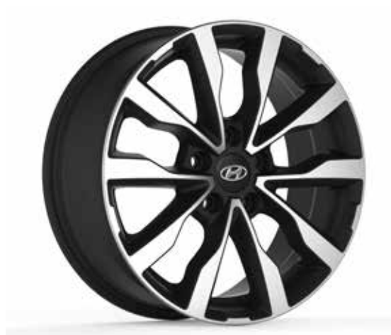
3. Alloy wheel kit 17" 17" Stylish black and polished alloy wheel, 7.0Jx17", suitable for 215/55 R17 tyres. Kit includes a central cap W15KONA1