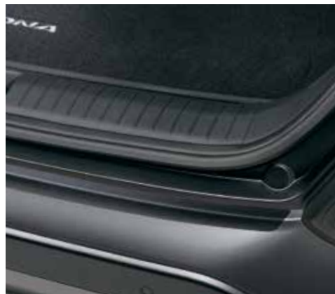
Rear bumper protection foil, black