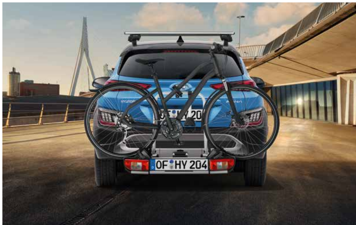
Bike carrier for all tow bars