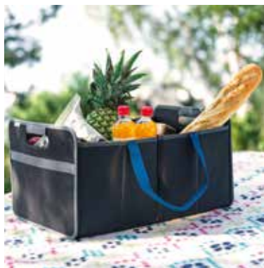
Trunk organizer, foldable