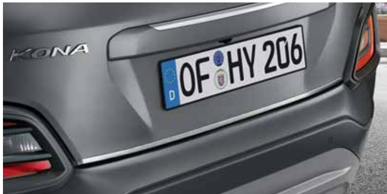
Tailgate trim line, brushed