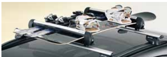
Ski & snowboard carrier 600

Your KONA is destined for fun outside. So why not extend its range to suit your outdoor needs.