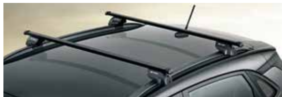
Cross bars, steel