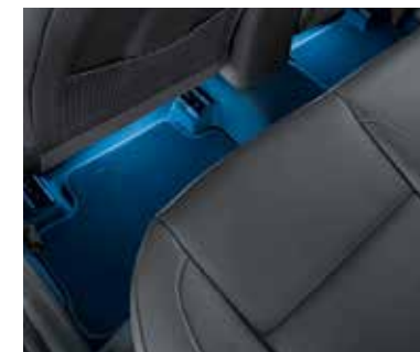
LED footwell illumination, blue, second row