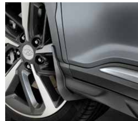
Mud guard, front

Made-to-measure, made-to-protect. No matter what your cargo, this mat keeps your trunk looking like new for longer. Made from high-quality velour and featuring the KONA logo. J9120ADE00 (non-reversible, full coverage)