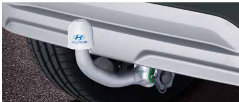
Tow bar, detachable

Maximum towing load capacity will depend on your car's specification. Please consult your dealer for further information. All Hyundai KONA Genuine tow bars are corrosion resistant, certified by ISO 9227NSS salt spray test, and comply with OE Car Loading Standard (CARLOS) – Trailer Coupling (TC) and Bike Carrier (BC) requirements.