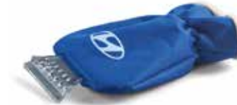
Ice scraper with glove