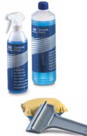
Winter car care kit