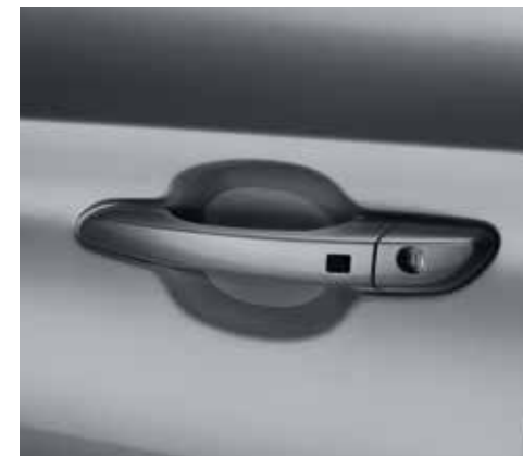
Door handle recess protection foil