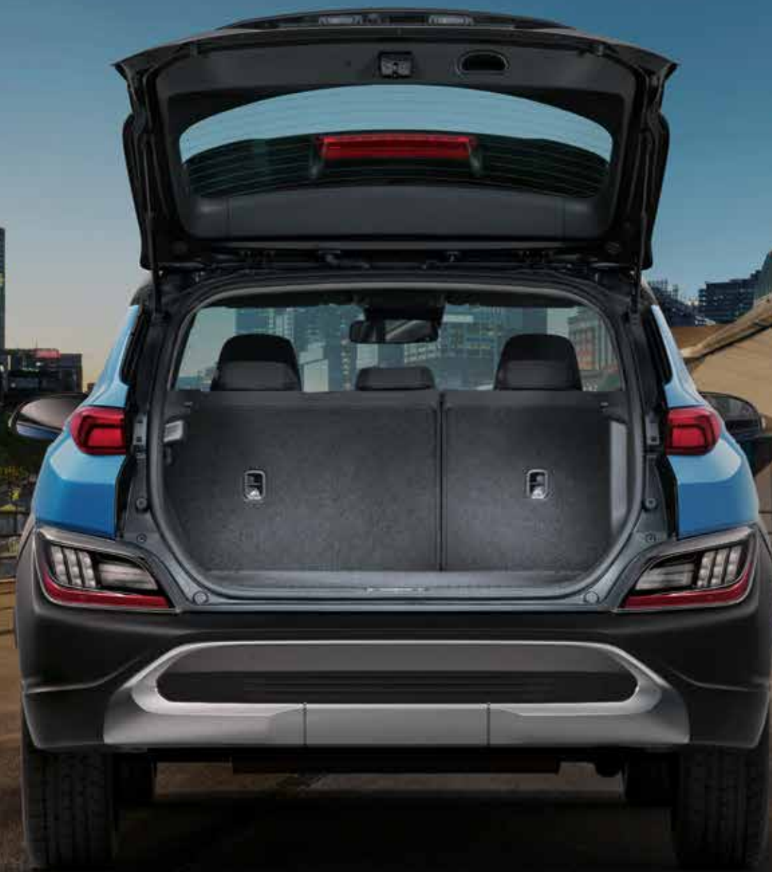
LED trunk and tailgate lights