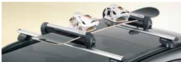
Ski & snowboard carrier 400