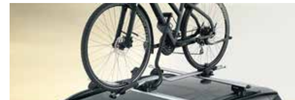
Bike carrier Pro