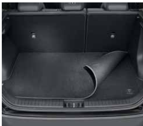
Trunk mat, reversible